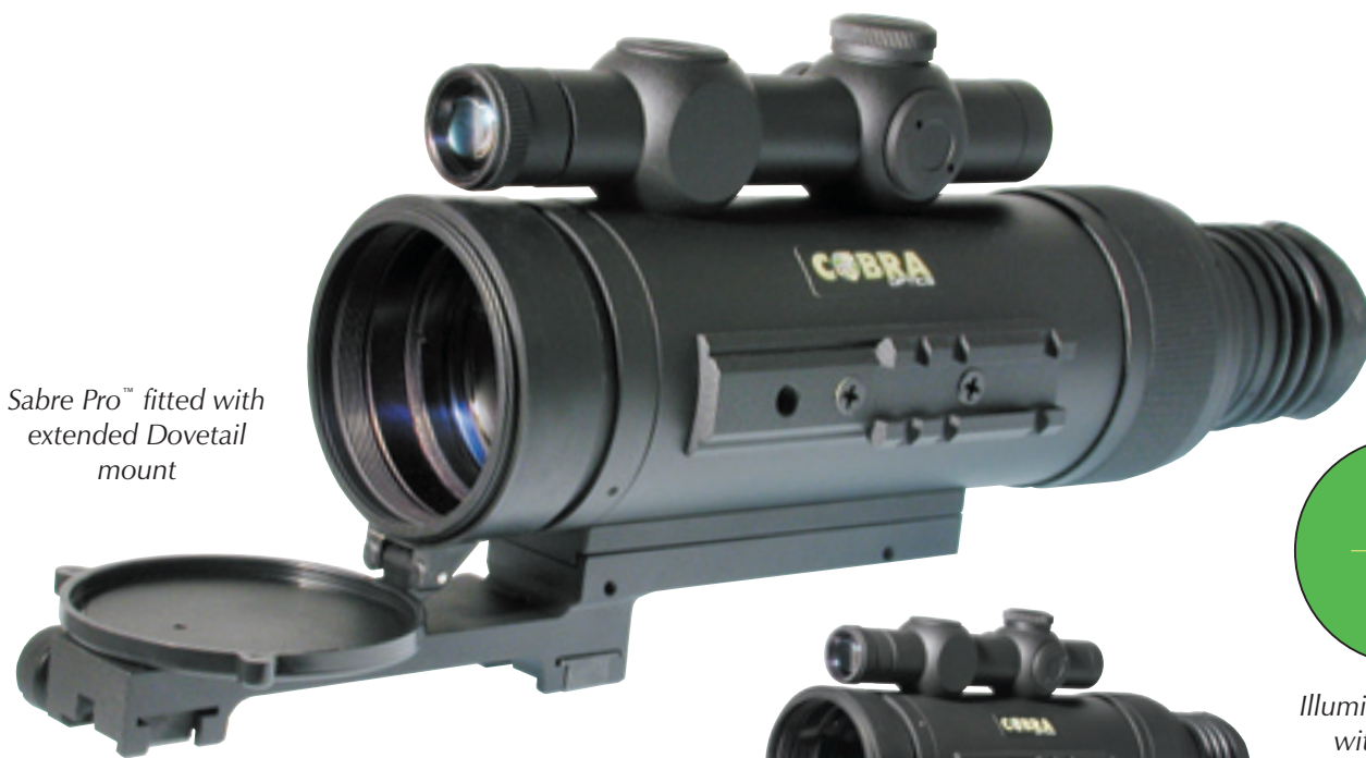
Sabre Pro™ fitted with extended Dovetail mount