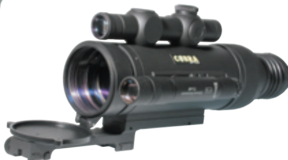
Sabre Pro™ fitted with optional High Power 75mW IR Illuminator (150mW also available)